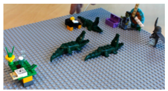
"Many teachers feel threatened..."